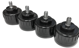
Self-Leveling Base Glides