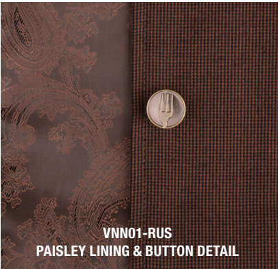
VNN01-RUS PAISLEY LINING & BUTTON DETAIL