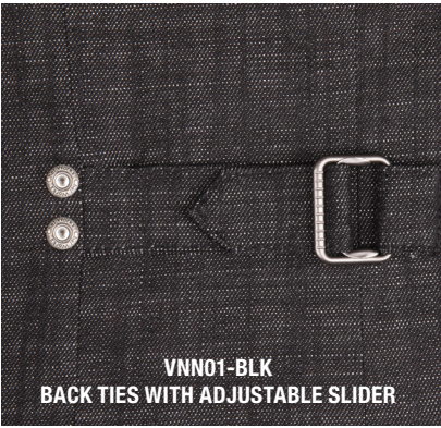
VNN01-BLK BACK TIES WITH ADJUSTABLE SLIDER