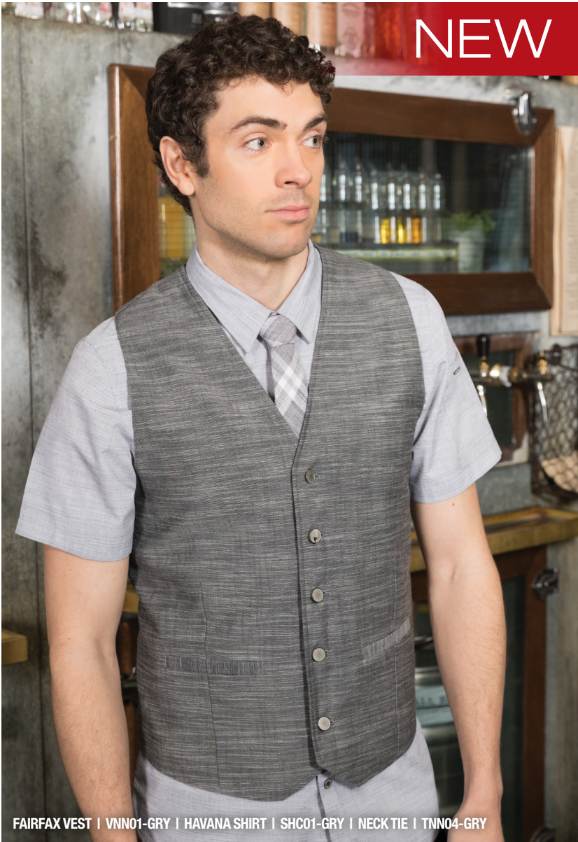
FAIRFAX VEST | VNN01-GRY | HAVANA SHIRT | SHC01-GRY | NECK TIE | TNN04-GRY