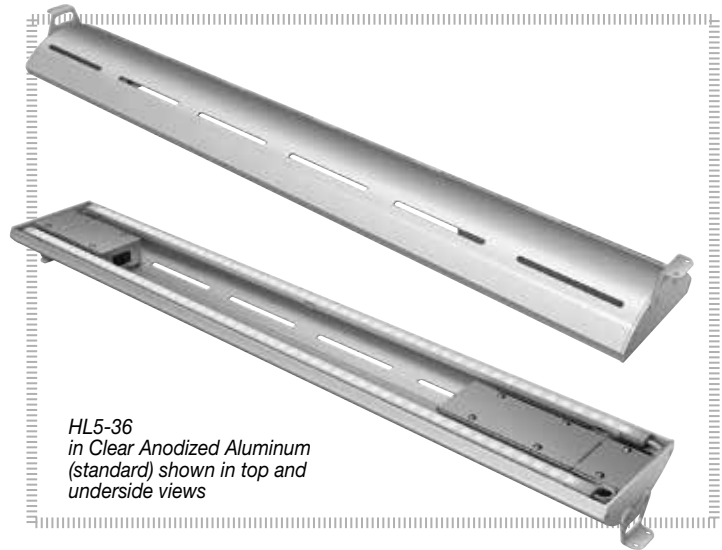
HL5-36 in Clear Anodized Aluminum (standard) shown in top and underside views