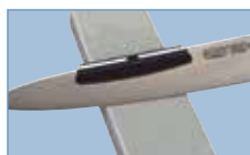
K-4G in use