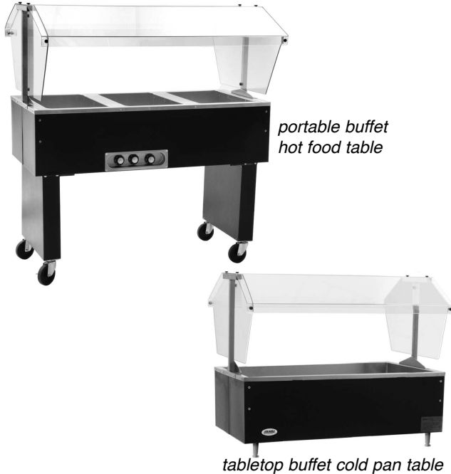
portable buffet hot food table

Eagle Deluxe Service Mates Buffet Cold Pan Unit, model _____ . Polished stainless steel insulated ice cold pan, 6" deep with black vinyl on steel body. Clear polycarbonate sneeze guard. Portable units feature black vinyl base and 4" swivel casters, two with brakes. Tabletop units feature adjustable feet for mounting onto tabletop.