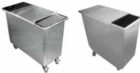
DN-FB84 & DN-FB124 DN-FB100