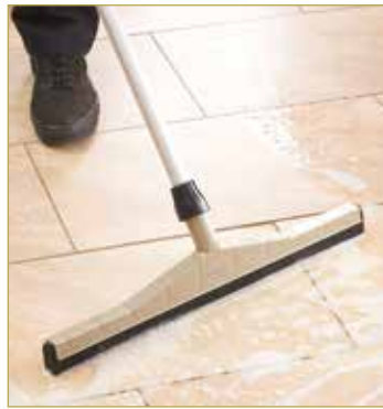
Adapts to variety of surfaces