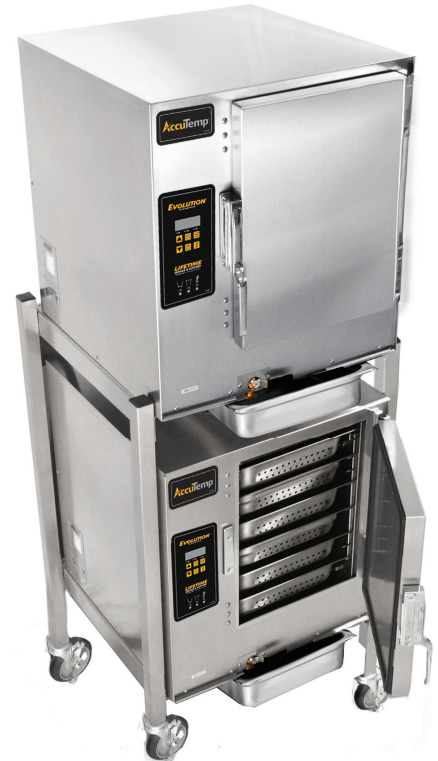
E6 Evolution™ models shown double-stacked on stand with optional casters and drain pans

Evolution™ steamer is AccuTemp Products' electric, connectionless, boiler-free steamer that utilizes AccuTemp's patented Steam Vector Technology™ for faster cook times, improved energy efficiency, and better pan-to-pan uniformity. Steam Vector Technology utilizes no moving parts inside the cooking chamber. Steam is produced inside the cooking cavity with no heating element exposed to water. Certified holding cabinet. No water or drain line. Steamer includes low water, high water, over-temp warning lights and auto shut off feature. Evolution includes heavy duty, one-piece field reversible door. Standard digital controls with independent timer. No water quality exclusions in warranty. No water filtration or treatment required. Lifetime Service & Support Guarantee. Steamer is UL Safety and Sanitation Certified, and ENERGY STAR® qualified. Made in the USA.