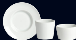
Tumbler 6302P262 D 2 1/4" H 2" (3 oz) 6302P263 D 2 1/4" H 1 3/8" (1 3/4 oz) Underliner Dish 6302P261 D 4"