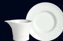
Pourer 6302P264 L 3 1/4" H 2 1/4" (3 oz) Underliner Dish 6302P261 D 4"