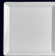
Square Tray 6302P271* L W 9 1/2"