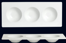
Rectangular Sorbet Dish w/ 3 Wells 6302P267 L 12 1/8" W 5" H 1 1/8" (2 oz Each Well)