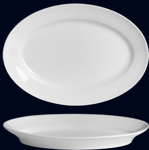
Oval Rim Platter 6302P250 L 15 1/2" W 10 7/8"