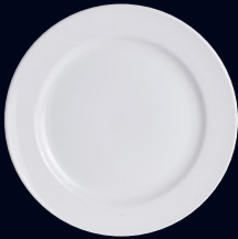
Plate 6334P467 D 11" (Plate Cover 5379S792) 6334P466 D 10 1/4" (Plate Cover 5379S791) 6334P465 D 9 1/2" 6334P464 D 7 3/4" 6334P461 D 6 1/4"