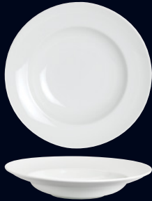
Pasta/Presentation Bowl 6334P488 D 11" H 2 1/8" (22 oz) (Plate Cover 5379S792)