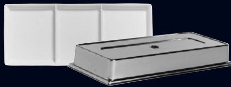
3 Compartment Stacking Tray 6302P279 L 15 7/8" W 6 5/8" Plate Cover 5371S500 L 15 7/8" W 6 5/8"