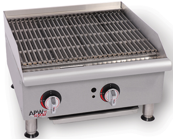
Model GCRB-24i Gas CharRock CharBroiler