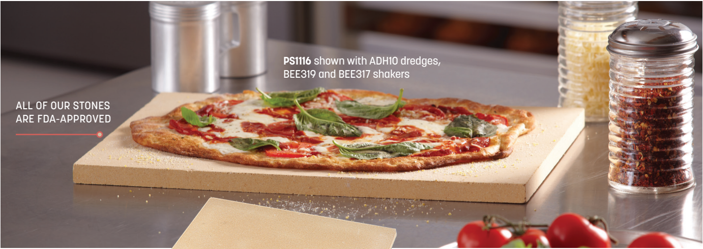
PS1116 shown with ADH10 dredges, BEE319 and BEE317 shakers