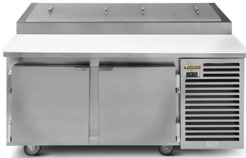
Representative, 2-door model shown

91" WIDE MODEL TB091SL2S - 2 ROW TB091SL3S - 3 ROW