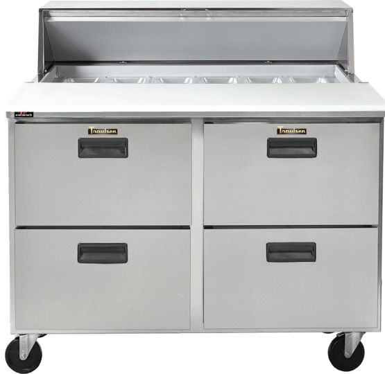
48" WIDE MODELS CLPT-4818-DW