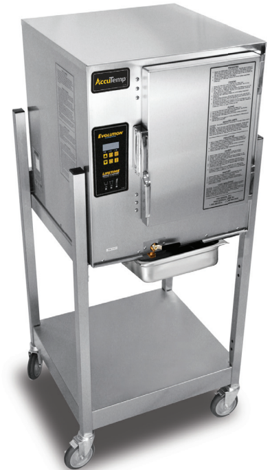
N6 Evolution™ model shown on stand with optional casters and drain pan

Evolution™ steamer is AccuTemp Products' gas, connectionless, boiler-free steamer that utilizes AccuTemp's patented Steam Vector Technology™ for faster cook times, improved energy efficiency, better pan to pan uniformity, and less water consumption. Steam Vector Technology utilizes no moving parts inside the cooking chamber. Steam is produced inside the cooking cavity with no heating components exposed to water. Certified holding cabinet. Steamer is powered by a heavy duty stainless steel power burner. Uses less than 1 gallon of water per hour. Steamer includes low water, high water, over-temp warning lights, and auto shut off feature. Evolution includes heavy duty, one-piece field reversible door. Standard digital controls with independent timer. No water quality exclusions to warranty and no water filtration or treatment required. Lifetime Service & Support Guarantee. Steamer is UL Safety and Sanitation Certified, and ENERGY STAR® qualified. Made in the USA.