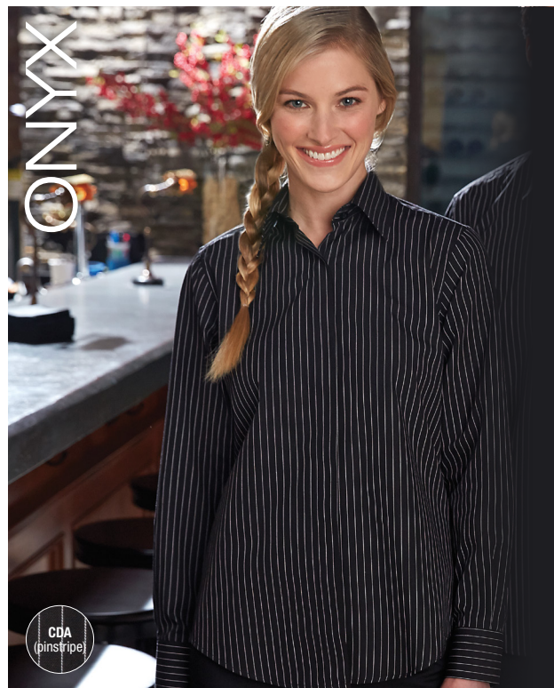
3.3 oz. yarn-dyed 65/35 poly/cotton, built-in collar stays, adjustable cuffs, double back yoke, covered placket Available in CDA