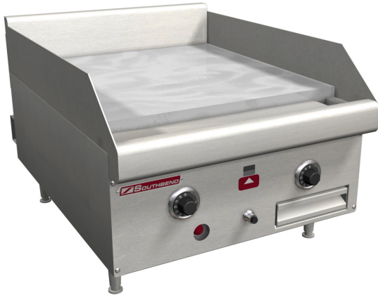
Model shown HDG-24-316L