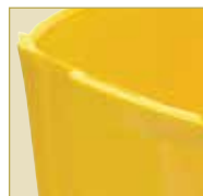
Easy-access slot on bucket fits 2" wide putty knife