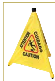
Set includes pop-up "Caution" cone