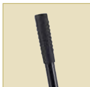
Powder-coated wringer handle with rubber grip