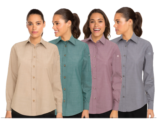
4 oz. poly/cotton blend, anti-wrinkle finish, back yoke with boxed pleat, roll-up long sleeve with button tab, faux horn buttons, left sleeve cell phone pocket