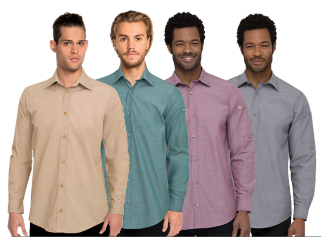
4\ \text{oz.} poly/cotton blend, anti-wrinkle finish, back yoke with boxed pleat, roll-up long sleeve with button tab, faux horn buttons, left sleeve cell phone pocket

Available in ECR, GRM, DUR, GRY CF 1 MEN'S: SLMCH005 | XS-3XL