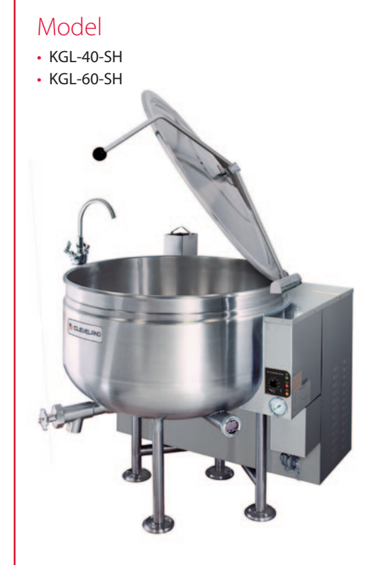
Shown with optional Hot & Cold Water Faucet