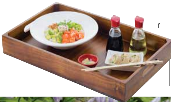
Solid wood construction and reinforced corners