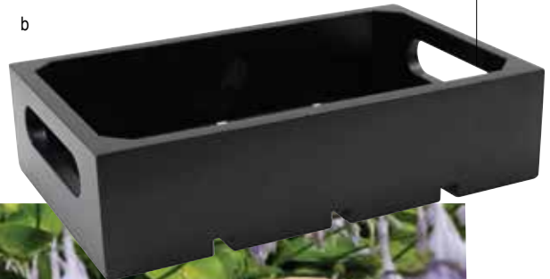
Handles for convenient transporting