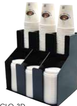
CLO-3D 12-11/16"L x 8-5/8"W x 12-1/4"H