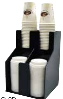
CLO-2D 8-1/2"L x 8-5/8"W x 12-1/4"H