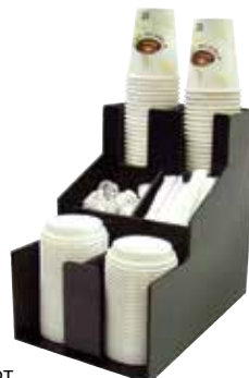
CLSO-2T 8-1/2"L x 13-1/16"W x 12-3/16"H