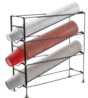
CDR-3 20"L X 6-1/4"W X 19-1/4"H