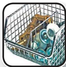
Shown with optional Divider (Sold separately)