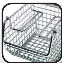
Shown with optional Side Stacking Ledge Pair (Sold separately)