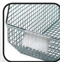
Shown with optional HBL3C Clear Label Holder Fits 1-1/8" x 3" Label (Sold separately)

INSTANT VISIBILITY NO DUST OR DIRT BUILDUP ALL WELDED