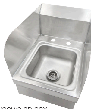
Model #CSW9-2D-SSX (See Above for Options)