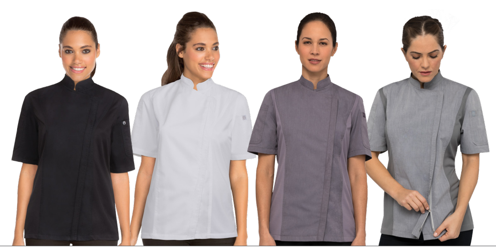
4.7 oz. 65/35 poly/cotton 'lite' twill fabric, Cool Vent™ sides, side seam slits, short-sleeve, single-breasted with zipper closure, back collar apron holder with engraved snap, left sleeve rounded thermometer pocket, right sleeve rounded cell phone/notebook pocket Available in BLK, WHT, PUR, GRY