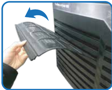
Remove air filter by sliding forward

Built in Carbon Block Water Filter (One unit is included when you buy a new machine)