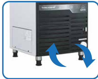
Front, in/out ventilation for optimal air flow and efficient production