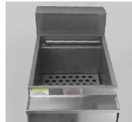
Special stainless steel alloy vessel withstands strong salt concentrations.