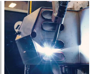
Robotic welding is precise, virtually eliminating leaks.