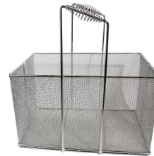
Each pasta cooker includes (1) large basket