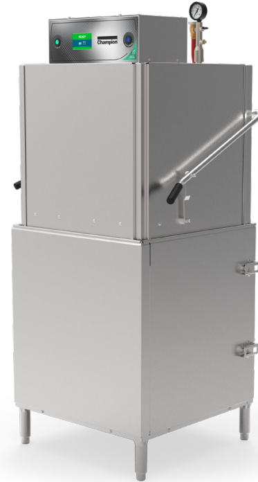
Rendered image is for general visual representation only. Please refer to specifications for the latest detailed product information.