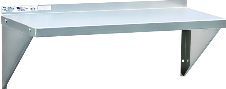
Solid Wall Shelf • H.D. & Standard