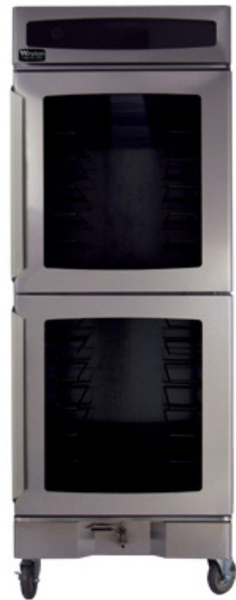
Model Shown: HOV5-14UV

The original humidified holding cabinet is still the best. CVap technology uses dry and vapor heat, in tandem, to control food temperature, and maintain it as moist or crisp as you want. Learn more at winstonfoodservice.com .