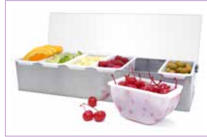
CDP-6 shown filled

There is no space for ice under the compartments.